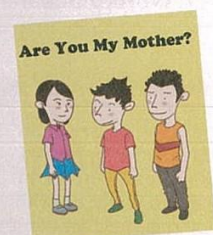
Are You My Mother?

Lucky orphan children will find new parents and you can watch! This show involves three children looking for new parents. Watch on Tuesdays at 6 p.m., as we interview candidates to be the children's new parents.