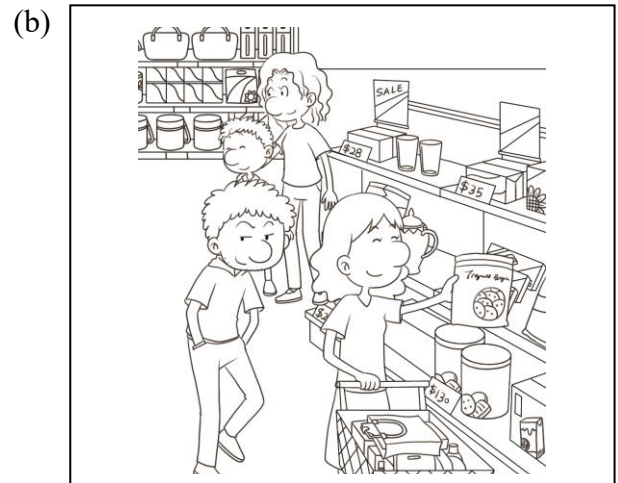
pocket / mobile phone