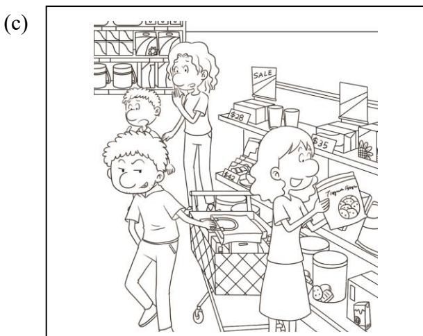
take out / scream