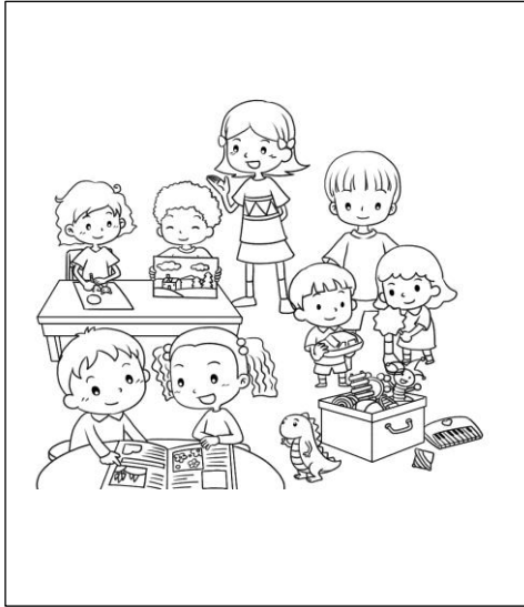
play / read / draw