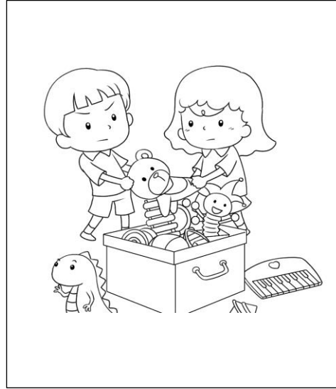
grab / tightly