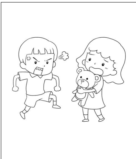
angry / shout at / loudly