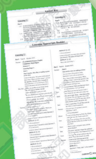
Answer-checking & Listening Tapescript Booklets

CLASSROOM Primary English Competency Mock Papers